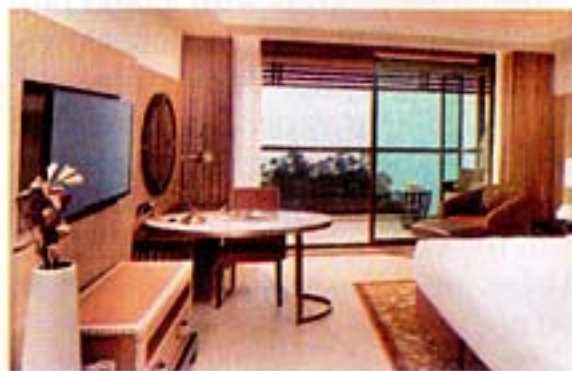
Marking a return to favour

sessions with chefs, and craft classes and other activities on offer.