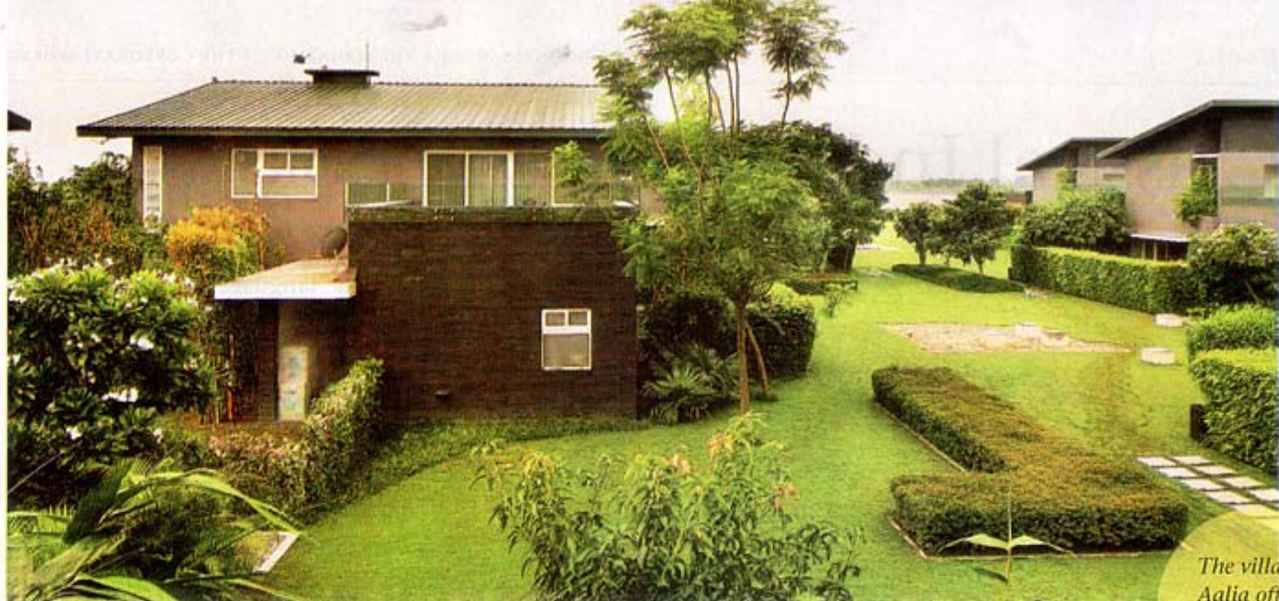
The villas at Aalia offer a home away from home

The concept provides the independence that a private house would provide and is large enough to house multiple couples and kids!